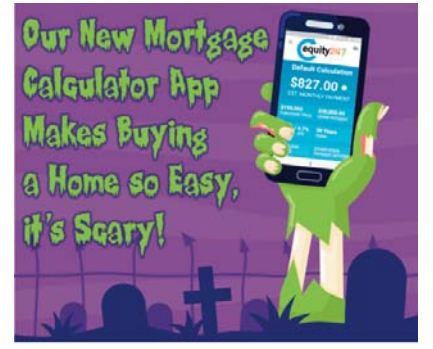
Send my Smartphone link to all your spooky friends!