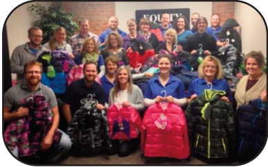
Our October Coats for Kids campaign was a great success!